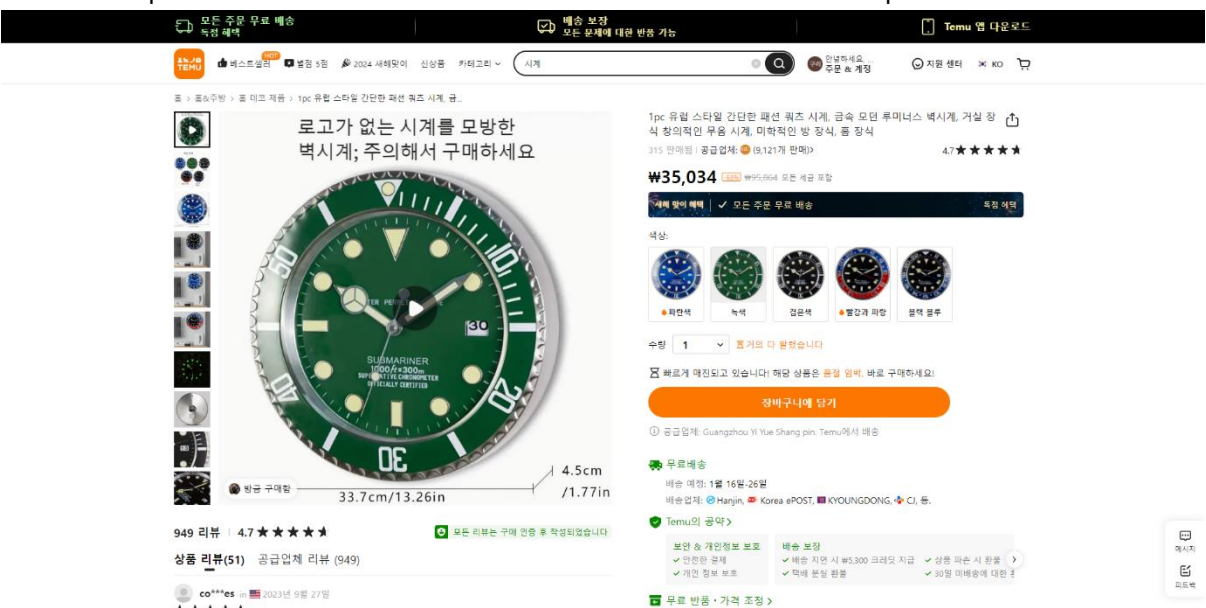
<Suspected counterfeit Rolex Submariner worth 26 million won>

To achieve this, customs must secure the product number and brand of the platform from the customs clearance list or import declaration items. What does it mean to secure a product number?