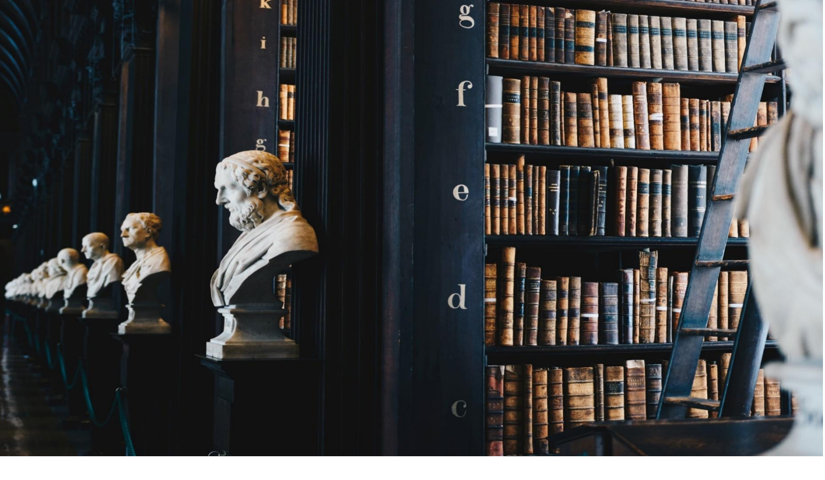
Global Customs Insight