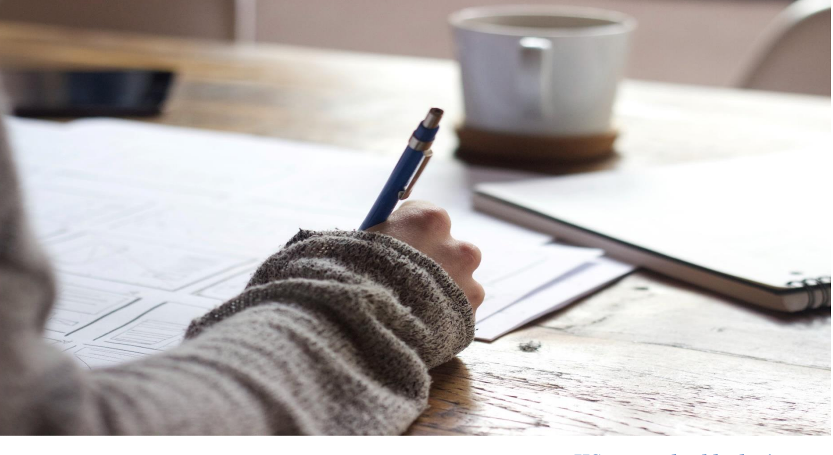
HS case solved by logic ltem classification for Mamicall